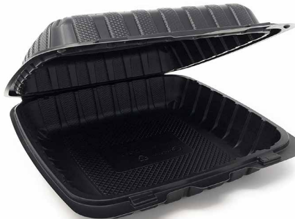
9" X 9" MFPP SURE EARTH 1/150 CT ORDER ITEM 595122