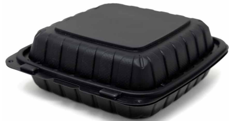
8" X 8" MFPP SURE EARTH 1/200 CT ORDER ITEM 595123