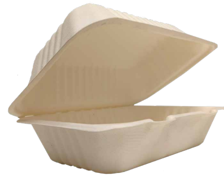
9" X 6" WIN SONE 2/75 CT ORDER ITEM 800703