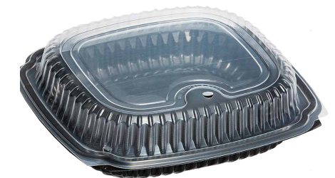
10" X 9" CULINARY CLASS 1/100 CT ORDER ITEM 6856