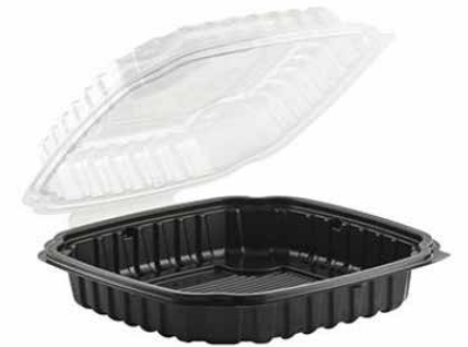
9" X 9" CULINARY LITES 1/120 CT ORDER ITEM 6730