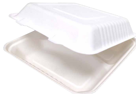
9" X 9" - 3 COMP WIN SONE 2/75 CT ORDER ITEM 800708