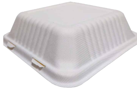
8" X 8" WIN SONE 2/75 CT ORDER ITEM 800768

Compostable, fiber containers are made from natural and renewable materials which help to pull carbon from the air and are regrown every year. These containers are compostable, so they can break down into the soil and help the crops to regrow. They complete a zero-waste circle, reducing the amount of trash sent to landfills.