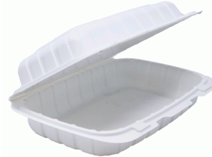
9" X 6" MFPP WELL CHOICE 1/150 CT ORDER ITEM 595129