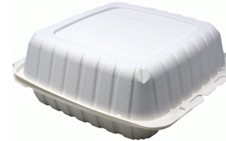
9" X 9" MFPP WELL CHOICE 1/150 CT ORDER ITEM 595127