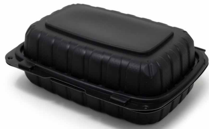
9" X 6" MFPP SURE EARTH 1/200 CT ORDER ITEM 595124