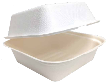
6" X 6" WIN SONE 2/200 CT ORDER ITEM 800766

These unbleached, sturdy fiber hinged containers can hold an array of foods and hold up to even heavy, greasy meals. Sturdy and versatile, these fiber containers are ideal for both hot and cold food applications. Stackable and ready to use, they have a perforated lid, which are easy to remove, making for a less cluttered dining experience.