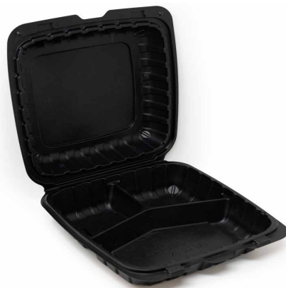
9" X 9" 3 COMP MFPP SURE EARTH 1/150 CT ORDER ITEM 595125