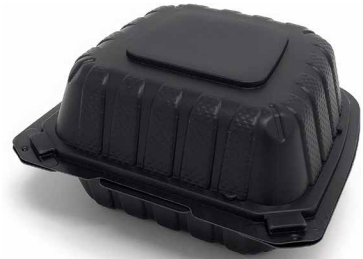
6" X 6" MFPP SURE EARTH 1/300 CT ORDER ITEM 900066

Mineral Filled Polypropylene (MFPP) Contains an average of 50% less plastic than standard takeout containers. Making this a sustainable and Eco-Friendly takeout option. BPA Free.