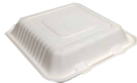
9" X 9" WIN SONE 2/75 CT ORDER ITEM 800702